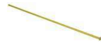
Telescopic tubes 1-2 m Art.No. 10985201