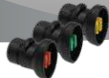
Fanjet nozzles (XR 8001 VS – XR 8008 VS) Art.No. 11612801-SB – 11612808-SB