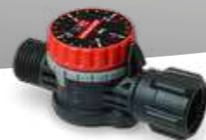
Adjustable pressure control valve PR 3 P1 Art.No. 12140001