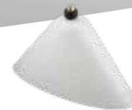
Spray hood oval, white Art.No. 10501606