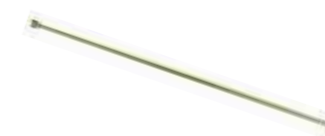
Extension tube 1 m Art.No. 10960601