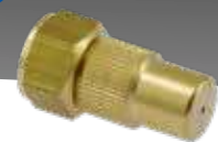
Adjustable nozzles 1.3 mm and 1.7 mm Art.No. 28502598-SB, Art.No. 28502597-SB

The guarantee for unrivalled quality and long life is the uncompromising use of high-quality materials, such as composite materials, brass and stainless steel.