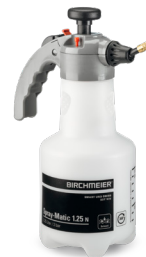
Spray-Matic 1.25 N (PA) / 360° Art.No. 11963301