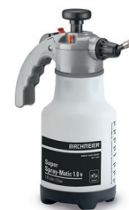
Super Spray-Matic 1.0 N (BMS 2010) Art.No. 12152101